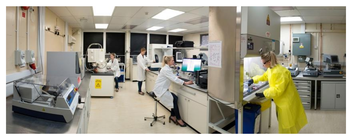
3D printing is a key focus of the laboratory, involving parts being built up layer by layer rather than being machined away from bulk material. The print material is typically a powder or wire feedstock that is melted using a laser or electron beam source.

The Advanced Manufacturing Laboratory is hosted by the STFC Rutherford Appleton Laboratory on the Harwell campus, directly adjacent to ESA's UK facility. Its key aim is to exploit the expertise and world-leading facilities that are on the Harwell campus, to assess new material processes, joining techniques and 3D printing technologies for application in space. It is an example of the collaborations that develop in the space cluster on the Harwell campus.